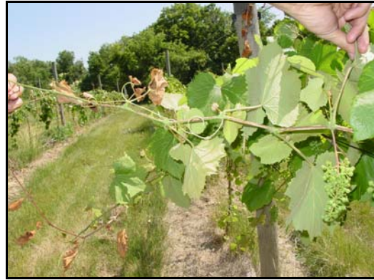
Egg laying tracks on shoots

Closer examination showed evidence of egg-laying tracks on both new shoots and one-year-old wood. These tracks are where females position themselves along a shoot and, using their abdomen, create slits in the surface of the shoot in a neat row, with 20-30 slits creating a single track. These tracks were 1/4-3/8" wide and 3-4" long. Each slit contained an egg or several eggs. It wasn't uncommon to see several tracks on a shoot and many shoots on a plant covered with tracks. Each track can disrupt the flow of the vascular system. If there are several on a shoot, the shoot can cease to function and die back to the damaged zone. This grower was seeing significant dieback in his vineyard. I recommended that he spray with Danitol and keep the plants protected with Danitol by repeating every 5-7 days until the adult population dies out, which should occur within 2-3 weeks. Then he will have the onerous task of cutting out dead wood and retraining plants for future productivity. The eggs laid in the tracks will hatch out into larvae, which will fall to the ground, bury themselves and feed on the roots of weeds and grasses for the duration of that stage of their lives. They won't emerge again as adults until 2024. In almost all cases, the plants should grow back fine but are delayed from reaching productive maturity.