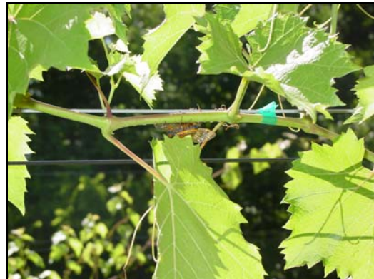
Cicadas laying eggs

While this incident is becoming history, it's important to note that our young industry has had few encounters with periodic cicadas. But it's certain it will in the future. Other broods of periodic cicada will emerge in future seasons. They will present a risk to vineyards, which are adjacent to protected, wooded areas. Other areas of the state may see this happen soon, including parts of central and southern Illinois in 2011. Grape growers in other regions of Illinois should be forewarned that if this insect emerges near their vineyard in the future, it could cause serious damage to their vines and their business enterprise. While the adult