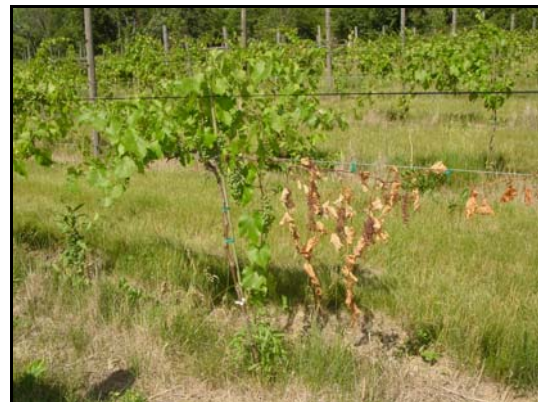
Cordon dieback due to cicada damage

This was a younger planting with many plants less than 4 years old. This meant a lot of new and 1 year old wood on the plants, the kind of wood cicadas like for egg-laying. As I approached the vineyard I noted the timber around the vineyard was alive with cicada noise and I began to see them flying around the grapes and from the timber into the vineyard. As we entered the vineyard I began to see his reason for concern. There were signs of shoots dying back and in a few cases plants were largely dead.